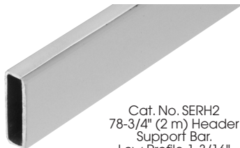
Cat. No. SERH2 78-3/4" (2 m) Header Support Bar. Low Profile 1-3/16" (30 mm) Height