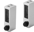
Cat. No. SERS2 Stoppers (2)