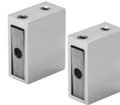
Cat. No. SERW2 Track Holder Fittings for Wall (2)