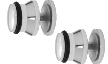
Cat. No. SERAL2 Anti-Lift Fittings (2)